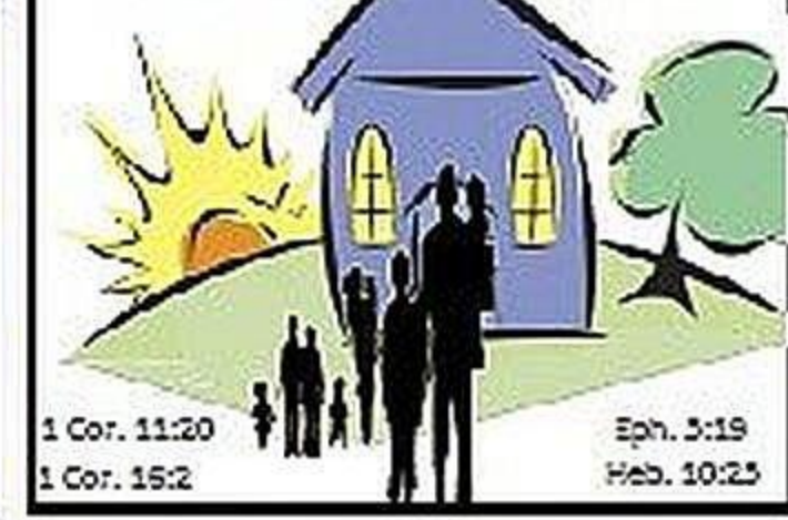
1 Cor. 11:20 1 Cor. 15:2

For Christ's sake: Go to assembly to worship God together.