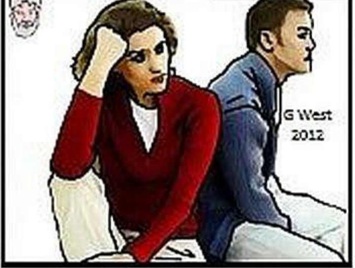
Philippians 3:8 Merk 10:29