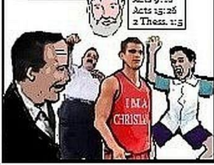
Matt. 5:12 Acts 9:16 Acts 15:26 2 Thess. 1:5