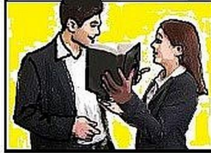
2 Cor. 4:5