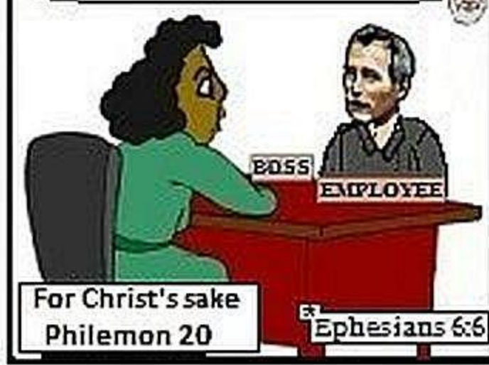
For Christ's sake Philemon 20

Masters and servants: not with eyeservice, as menpleasers; but as the slaves of Christ.