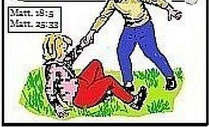
Matt. 29:5 Matt. 25:33