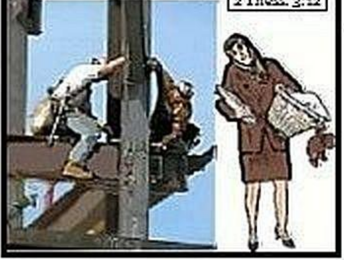
2 Thess. 3:12

Masters and servants: not with eyeservice, as menpleasers; but as the slaves of Christ.