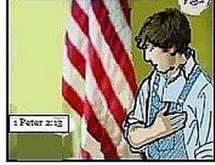
1 Peter 2:13